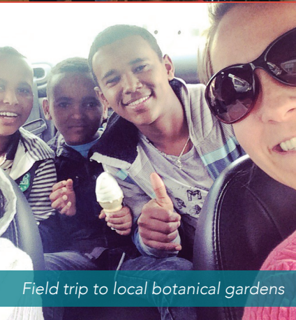
Field trip to local botanical gardens

USCRI – Des Moines expanded services to provide free legal immigration support to any refugee or immigrant in the community.