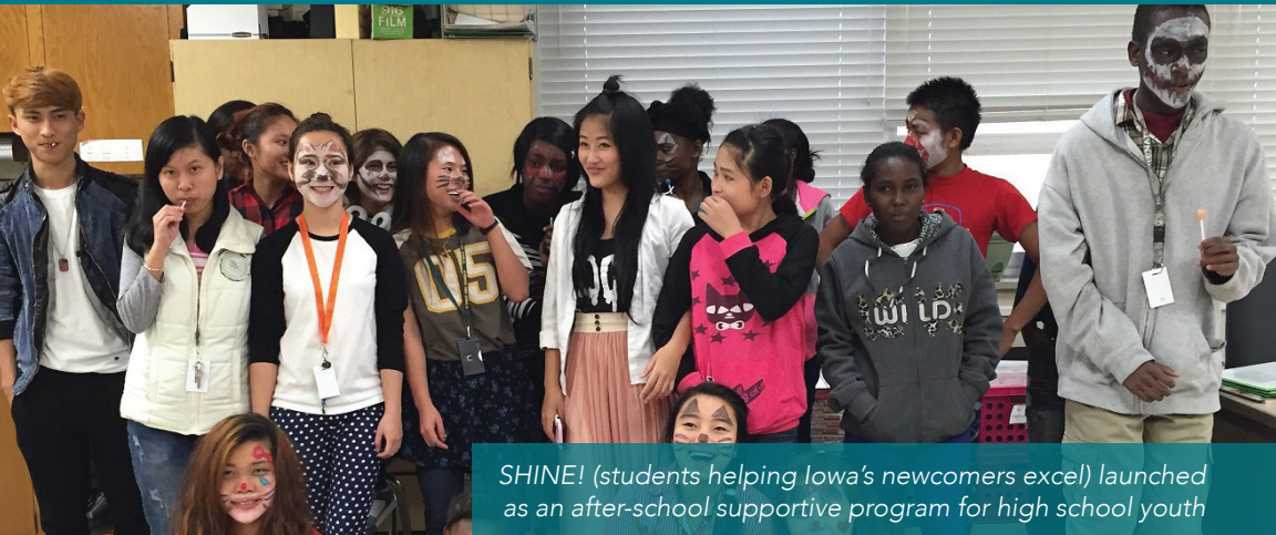
SHINE! (students helping Iowa's newcomers excel) launched as an after-school supportive program for high school youth