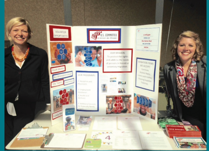
Mental Health mini-conference with over 200 attendees